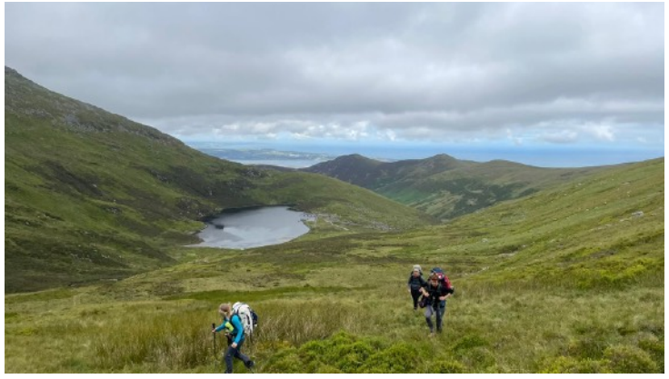
The cross country ascent from Llyn Anafon to Drum