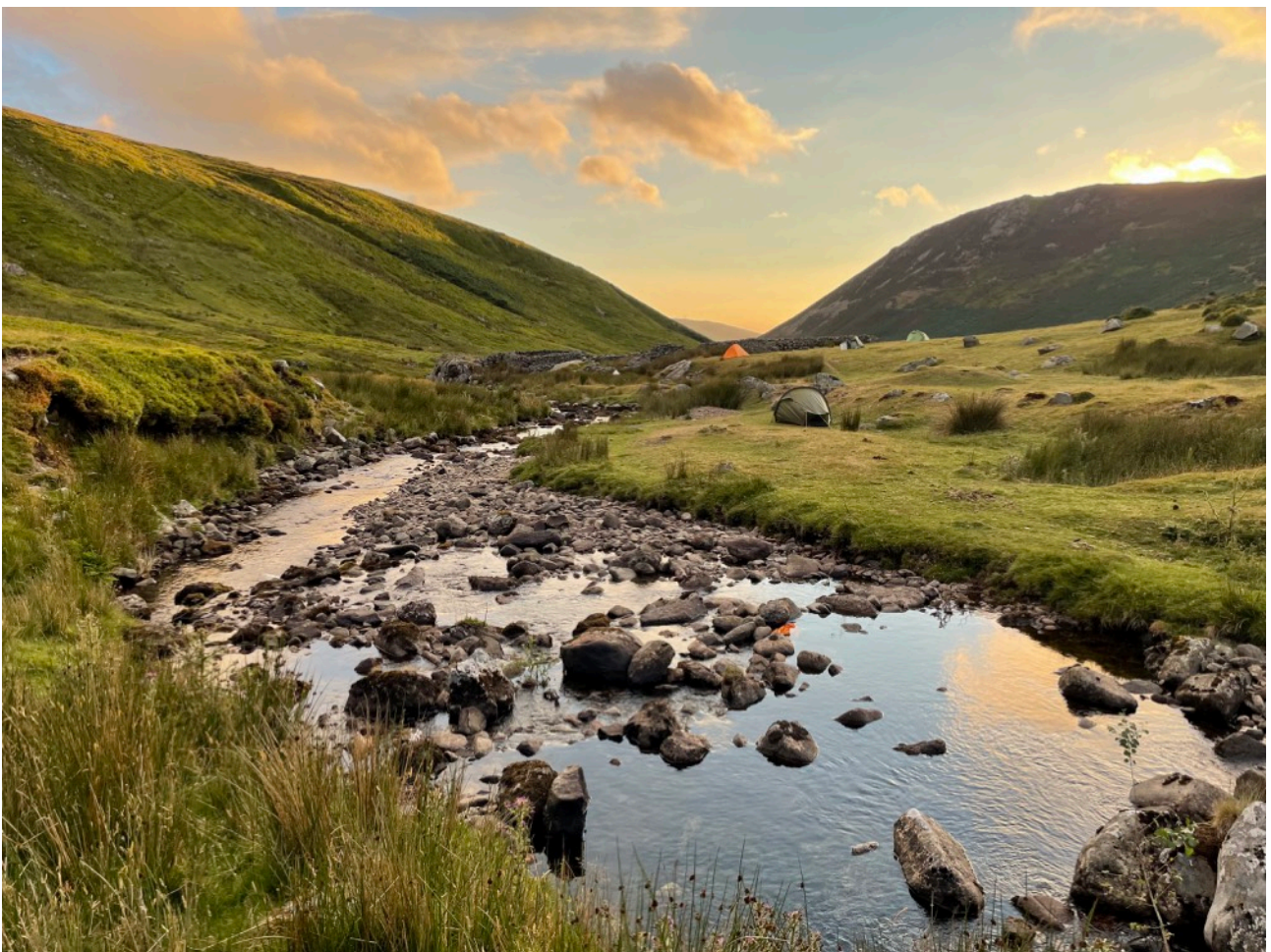
View west down the Afon Anafon valley towards our camp (mine was the green tent in the foreground).

The chosen valley to set up our camp had numerous ancient hut circles, the beautiful Afon Anafon and about twenty wild ponies cavorting around it. I pitched my tent close to the stream in a gorgeous spot. The beautiful golden sunset was shining up the valley.