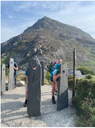
Slate window stones