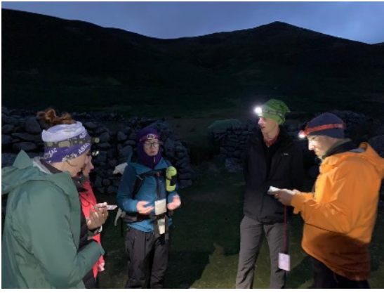
Night navigation session