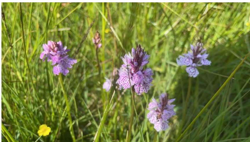
Heath Spotted Orchids